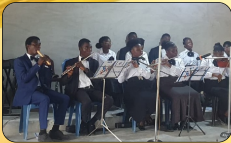
FUTMinna 2025 NRP

We did not only gather to sing; we worshipped. We were reminded of the pardon we received through the blood of Christ; how once we were lost, but now we are found; once condemned, but now forgiven. Through the playlets, we saw our own reflections, how humanity falls, wanders, and resists, yet is met again and again with the outstretched arms of a merciful Father. We were taught that to be truly pardoned is to live daily under the covering of grace, walking in humility and obedience to the One who redeemed us.