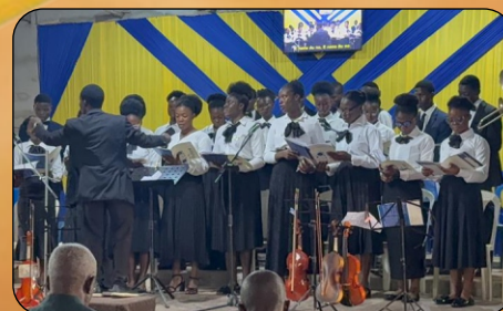
FUL/KSP 2025 NRP