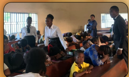
OOU Ibogun 2025 NRP