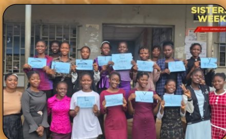
EKSU SISTERS' WEEK