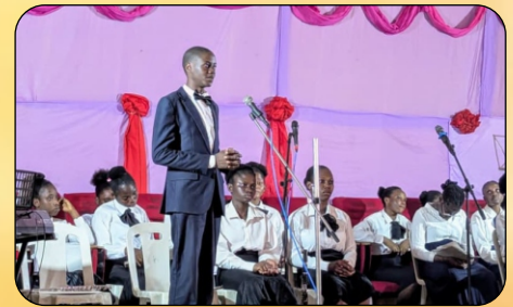
MAPoly 2025 NRP

Now, beloved, the connection becomes clear: those who are pardoned must become torchbearers. For what use is pardon if not to proclaim freedom? What use is mercy if not to shine it forth as light? Christ Himself declared, "Ye are the light of the world. A city that is set on a hill cannot be hid" (Matthew 5:14). Our pardon is the spark that ignites the torch, and that torch is the life we live, carrying Christ to nations, families, campuses, and communities.