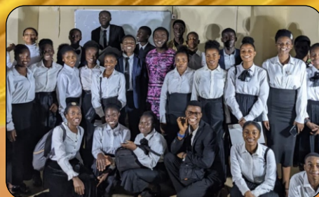
FedPoly Offa, Kwara 2025 NRP

May we remember this truth: forgiveness makes us free, and freedom commissions us to shine. May God help us to rise as pardoned torchbearers, walking in the light of Christ and carrying His fire to a waiting world.