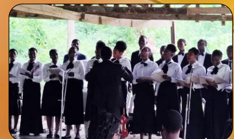
OOU Ibogun 2025 NRP