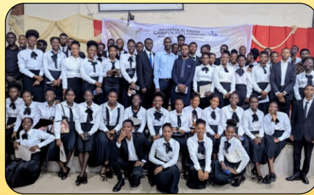
UNILORIN 2025 NRP