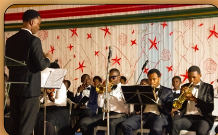
AFCF PTI 2025 NRP